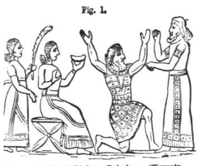
Woman with cup ** from Babylon.—(KITTO'S Biblical Cyclopædia.)

** The shape of the cup in the woman's hand is the same as that of the cup held in the hand of the Assyrian kings; and it is held also in the very same manner. - See VAUX, pp. 243, 284.